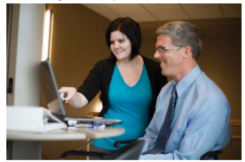
The University Center-Rapid City is expanding offerings and providing access to the greater Rapid City region.