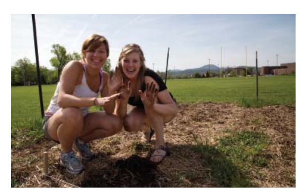
BHSU students take an active role in sustainability by participating in the campus garden and other campus activities geared toward preserving the environment.

Black Hills State University recently earned a national recognition with the 2014 APPA Sustainability Award presented at the national conference in California this summer.